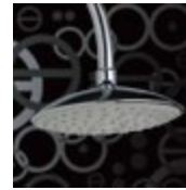
Garonne FMM 9380-0000