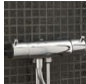
Garda FMM 9685-1530