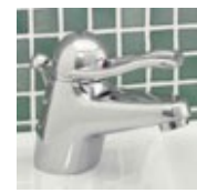
9000 series FMM 9055-0000