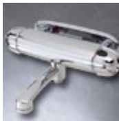
Iseo FMM 5600-5500