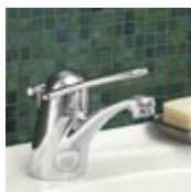
Iseo FMM 4555-0000