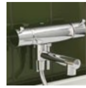
Garda FMM 9695-0000